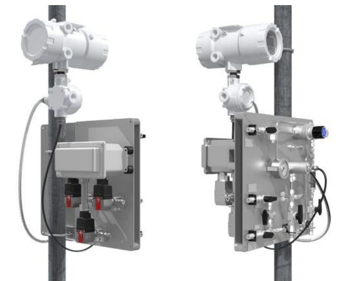
OXYvisor with Pipe Mount - AutoCal Panel