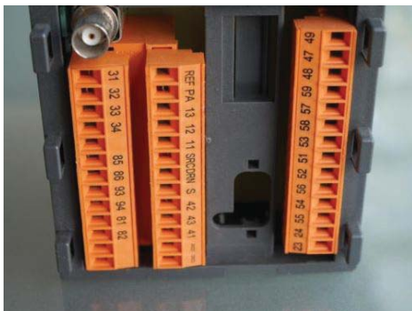
THE REAR TERMINATIONS OF THE LIQUISYS M CPM223 AS SEEN ABOVE - NOTE THE SEPARATE BNC CONNECTOR IN THE UPPER RIGHT OF THE PRODUCT